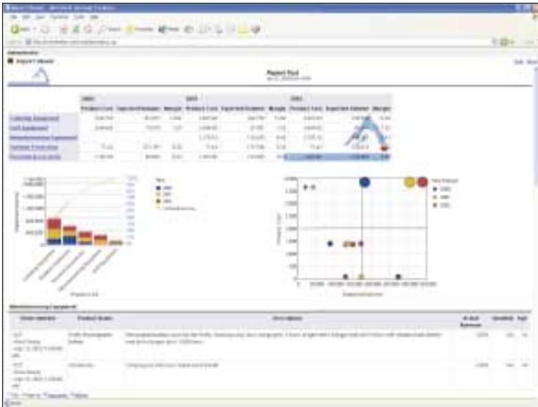
Multiple report types.